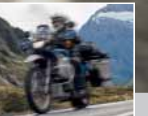
Two examples of a slow lens blur, the main image (left) shows what happens when you get it right. It can be a fine line between getting it right and getting it very wrong (below). Camera stability is key here.