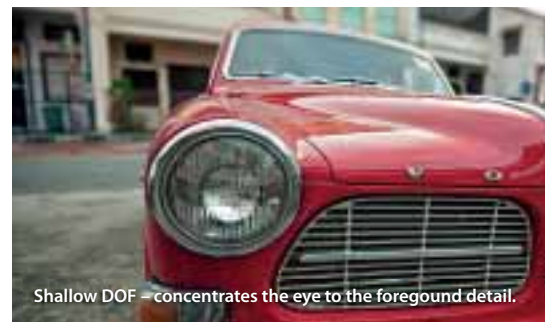
Shallow DOF – concentrates the eye to the foreground detail.

Rather than just clicking the shutter release and taking a snapshot, envision the photograph in your mind – the angle, the colours and the composition. If what you're seeing through the viewfinder is different from what you've envisioned then relocate, zoom in or out and adjust before clicking the lens.