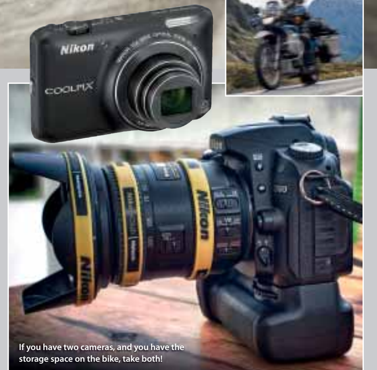
If you have two cameras, and you have the storage space on the bike, take both!

What a DSLR gives away in terms of its extra size, it more than makes up for in terms of flexibility (interchangeable lenses) and overall image quality and control. I want the images I capture to be crystal clear, with depth and true to life colour. My DSLR Nikon D3 gives me that. Most DSLRs also use larger sensors, which means I can print larger images or substantially crop and alter an image's composition and still be able to produce a quality print from the result. ▶