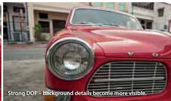
Strong DOF – background details become more visible.