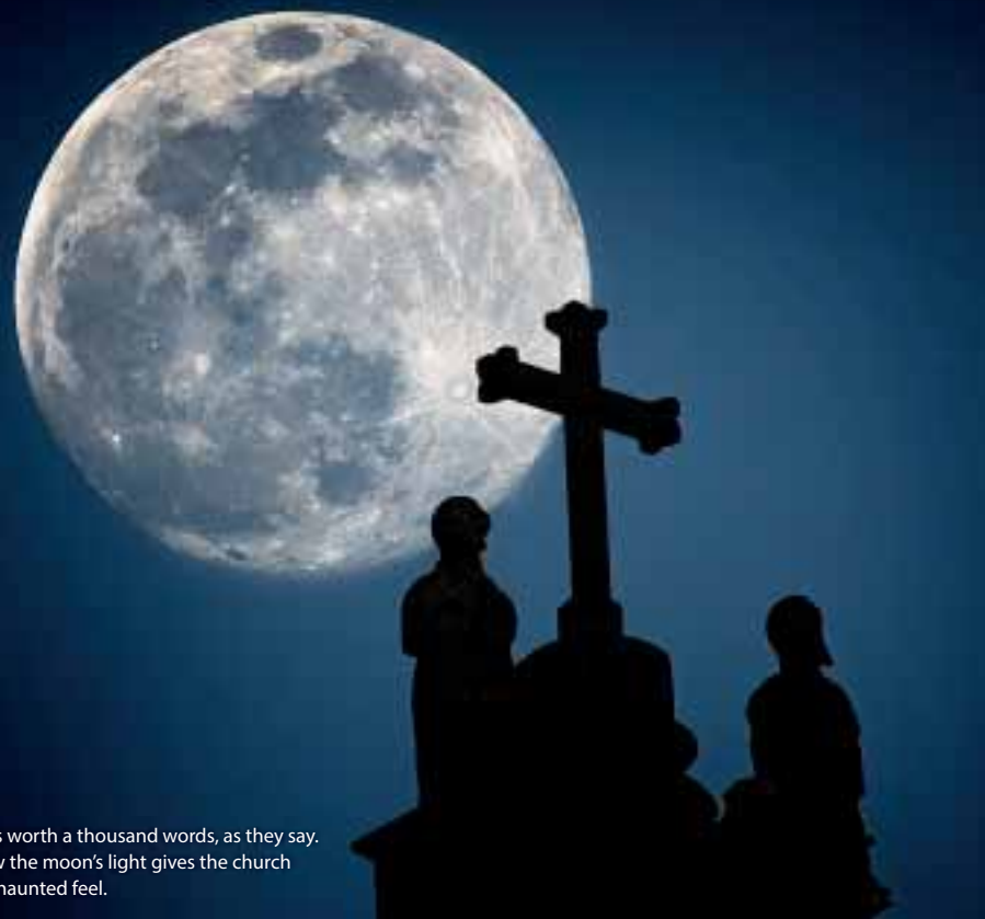
A picture is worth a thousand words, as they say. Notice how the moon's light gives the church and eerie, haunted feel.

buddy is about to cross, use a wide angled lens and get down, close to the ground for the shot. Shooting a portrait? Get the subject to hold out their arm and angle the camera down the arm towards their face, leading the viewer's gaze towards where you want it to be.