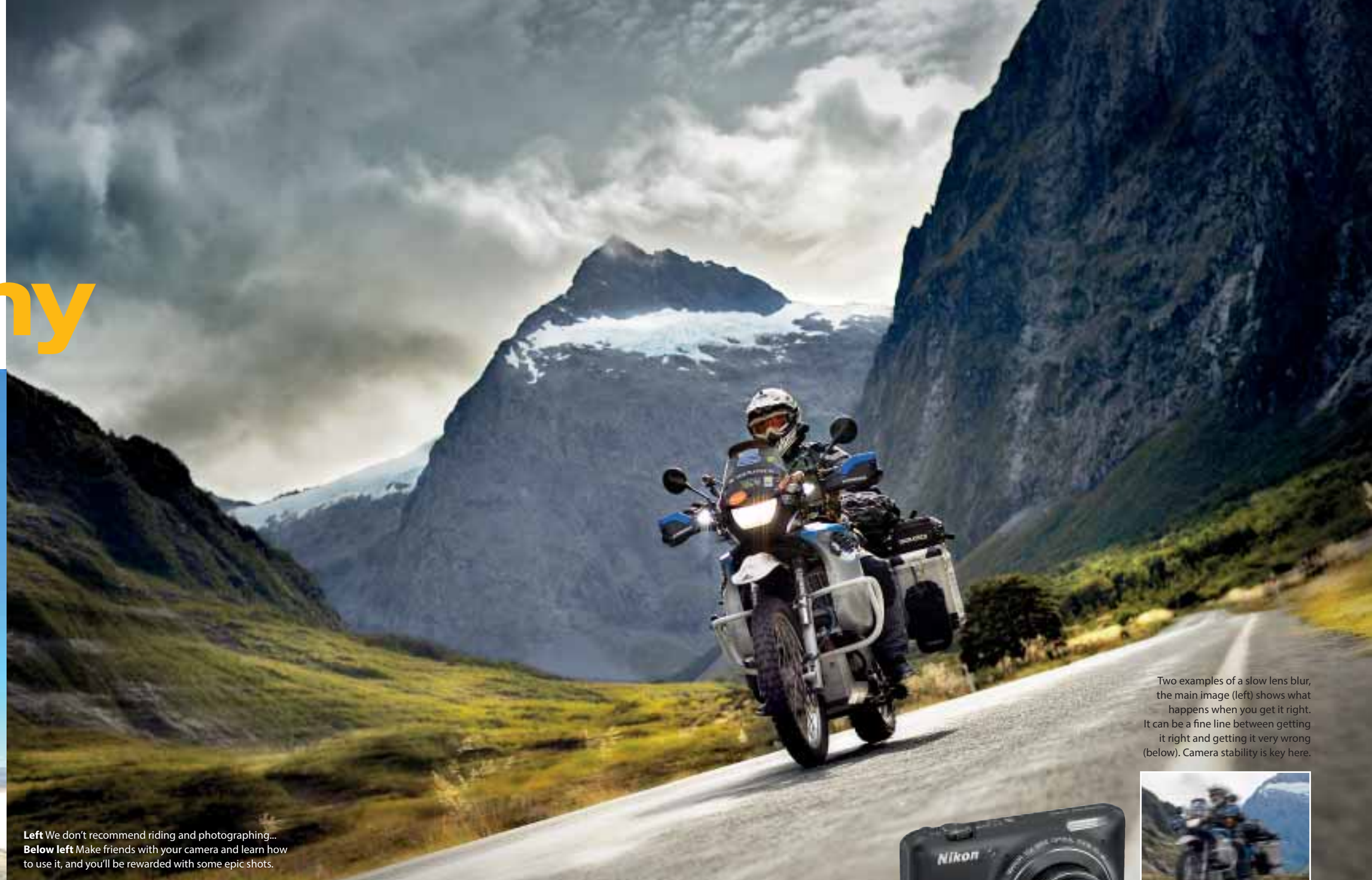
Left We don't recommend riding and photographing... Below left Make friends with your camera and learn how to use it, and you'll be rewarded with some epic shots.