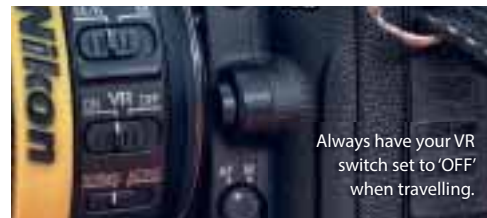
Always have your VR switch set to 'OFF' when travelling.

TIP: When travelling with lenses with built in Vibration Reduction (below), make sure you turn the VR switches to the 'off' position before hitting the road. VR system lenses aren't super happy travelling when not connected to a camera body.